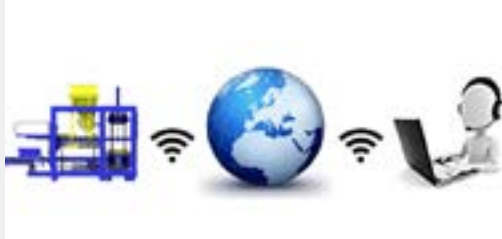
Online technical assistance